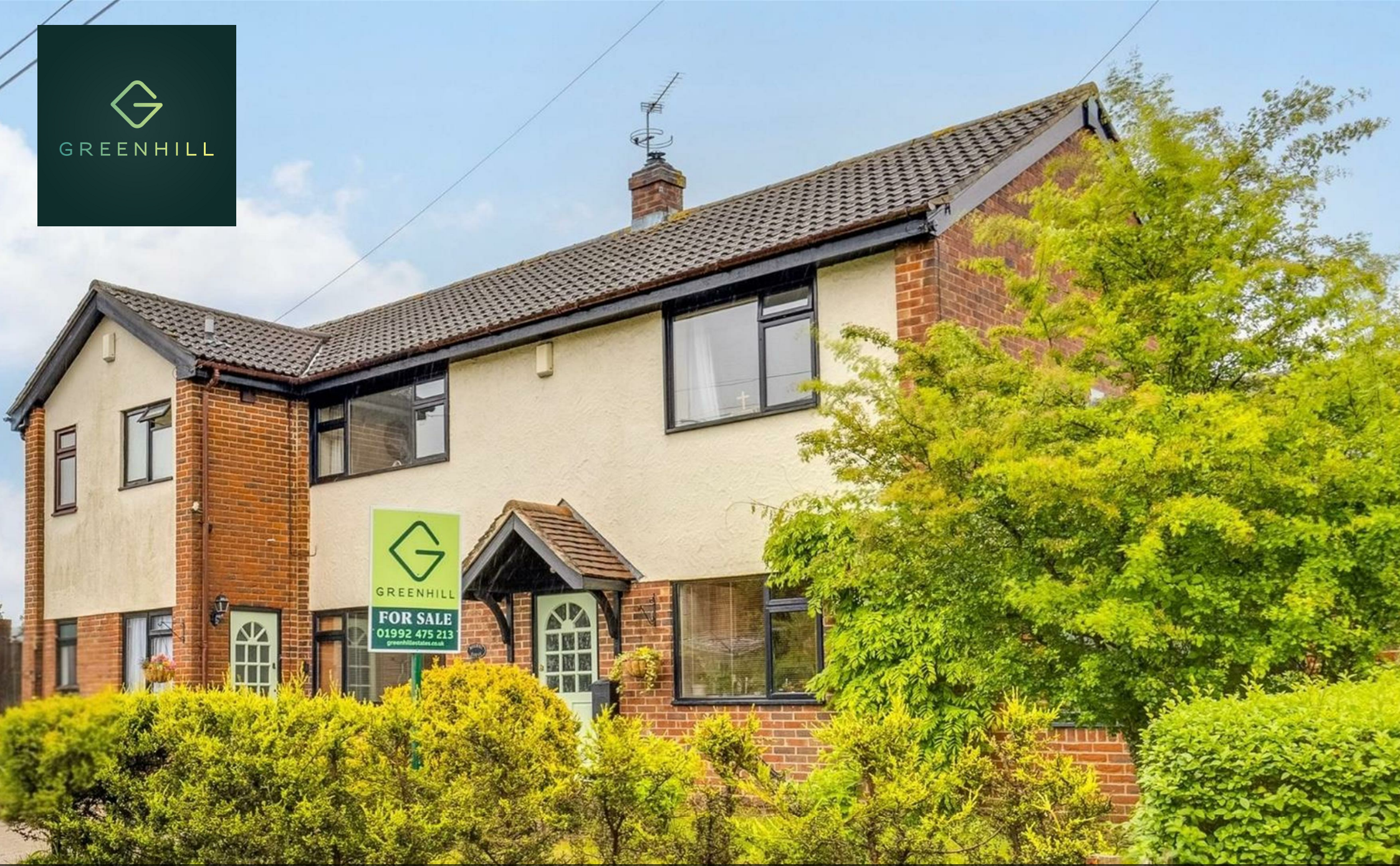
Bourne House Clapgate Albury, Ware, SG11 2JS Guide price £685,000